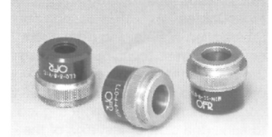
LLO Aspheric Lenses in RMS Cells.

*LL-3-2, LLO-2-2 and LLO-8-8 not available for HoYAG.