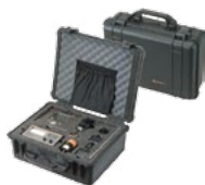
Pelican Carrying Case