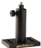
Stand with Delrin Post (Model Number: 200428)