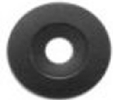
25mm Mount (MT-25)