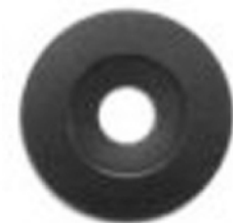
16mm Mount (MT-16)