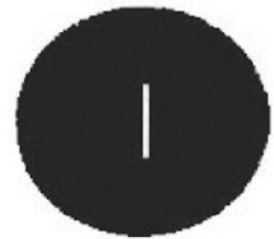
Blackened Air Slit

These blackened precision air slits may be used for optical applications requiring high resolution and low backscatter (stray reflected photons) for the input or output surfaces of the disc.