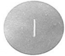
Precision Air Slit

These elements may be used as entrance, exit or intermediate optical slits for spectrometers, photometers and monochromators, or for fourier/optical image analysis and other wavelength discrimination demonstrations.