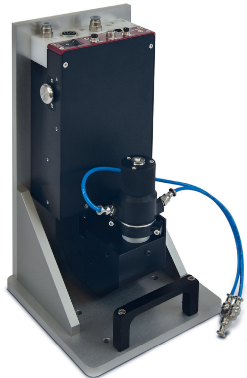
MSM-C redirection with attached cyclone