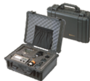
Pelican carrying case