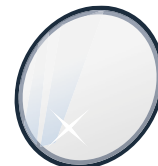
Permanent IR Windows (Various types available)