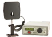
SDC-500 digital optical chopper